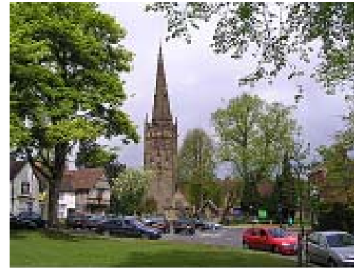
St Nicolas' Kings Norton